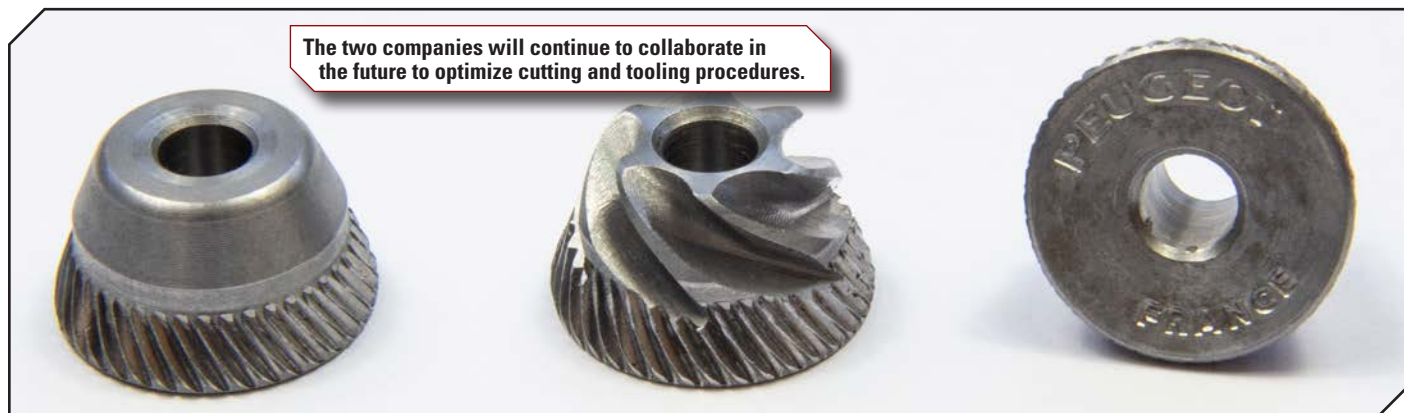
The two companies will continue to collaborate in the future to optimize cutting and tooling procedures.