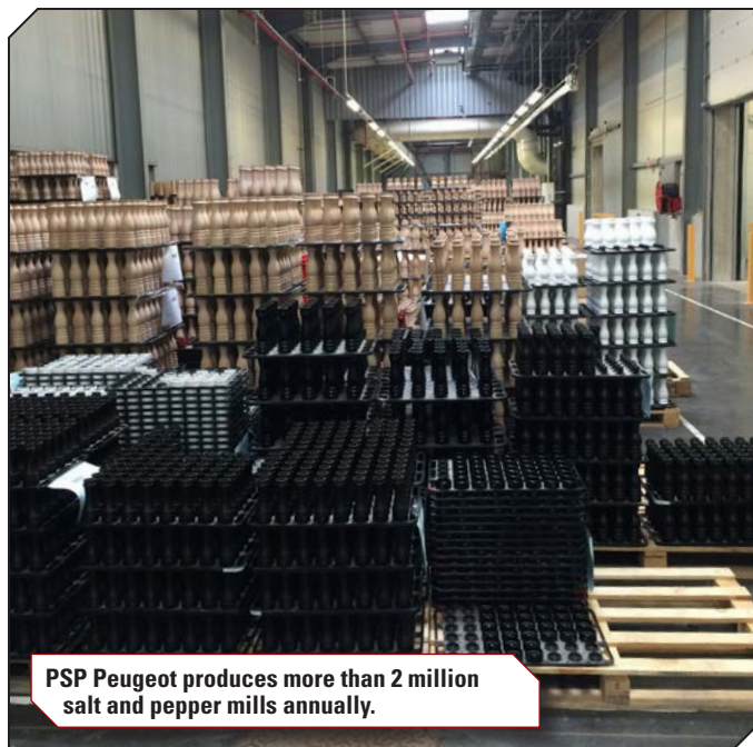
PSP Peugeot produces more than 2 million salt and pepper mills annually.

Blasomill GT 22 is a high performance cutting oil. It was developed specifically for machining stainless, acid- and heat-resisting steel, titanium and non-ferrous metals. It is suitable for milling, hobbing, drilling, turning, automatic turning, threading, tapping, broaching, reaming and sawing. It is also suitable for high-speed machines like Escomatic.